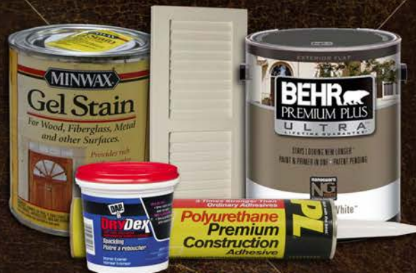
Any of the products above will be suitable for your project.

Our Euro-Lite HDF products are adjustable and can be adjusted with carpentry tools such as a table saw, circular saw, hand saw, or any other like tool. As a safety measure, be sure to always wear the right protective gear while cutting or trimming our products such as safety glasses and dust masks. You can also visit www.realmofdesign.com for the Material Safety Data Sheet (MSDS) on these products.